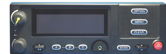
Figure 1: System (top) and Scan (bottom) Front Panels