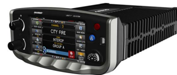
Unity ® XG-100M

ProFile is Harris' Over-the-Air Programming (OTAP) solution for reading and writing P25 IP , Enhanced Digital Access Communications System (EDACS ® ), and ProVoice™ radio personalities over the air. In operating and maintaining a trunking system, the system administrator periodically must change the personality of field radios. The majority of the changes deal with group structure, radio operating parameters, changes/additions to the configuration of the trunked system, and changes to encryption keys.